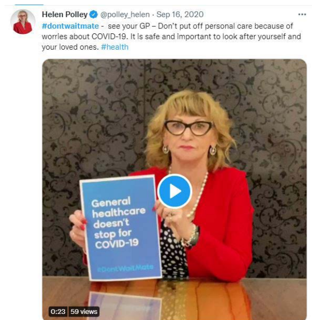
Above: Senator Helen Polley, right: the Hon Greg Hunt MP

#DontWaitMate was a great success with key politicians and significant personalities sharing the message on social media.