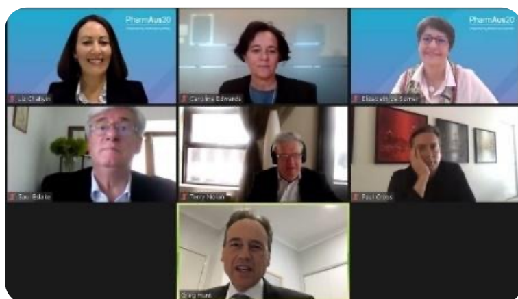
Minister Hunt addresses attendees at the PharmAus20 Digital Forum

You can read a full summary report on our website .