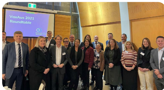
Attendees at the first VaxAus Roundtable event

The first ever VaxAus brought together vaccine developers and manufacturing companies for a roundtable. Key outcomes included exploring potential reform of the vaccines reimbursement process in Australia and aligning policy options for vaccine advocacy.