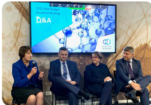
Q&A session at post-budget breakfast

138 attendees in Canberra and 140 in Sydney.