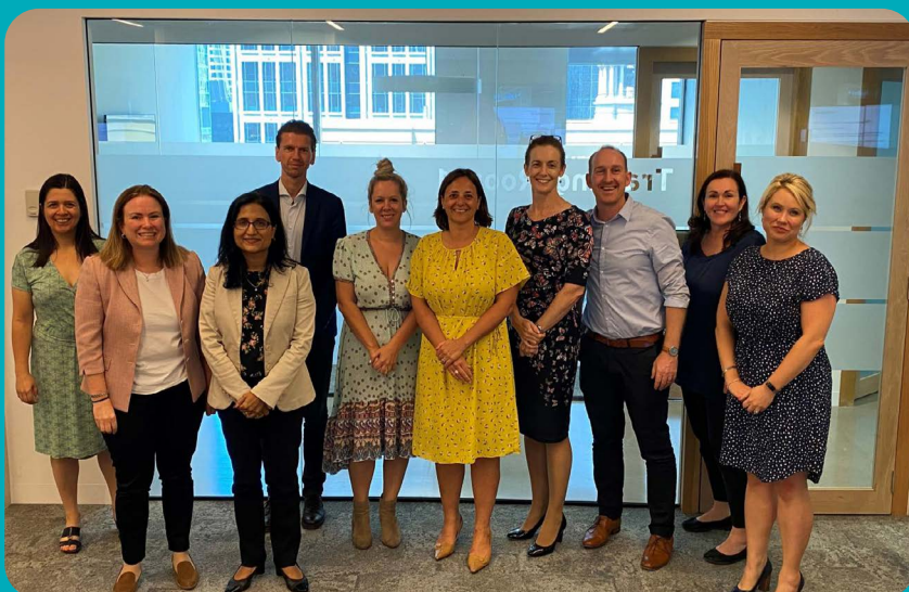
Some of the PAIG members meet in 2020

The PAIG committee has also commissioned a new White Paper that will be delivered in late 2021, which will delve into the future state of inclusive workplaces. As we move into 2022, PAIG will leverage insights from the White Paper and member company consultation to continue to evolve and find new ways to ensure that the industry is an inclusive and diverse workplace, with conditions that bring out the best in all people.